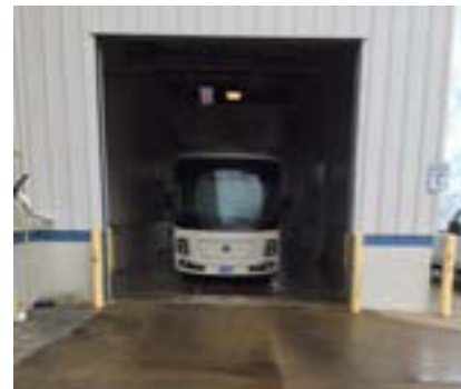
Service Center Rain Test Booth