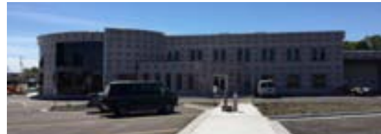
REV Service Welcome Center