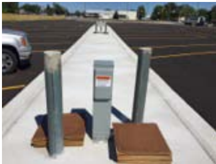
50A Power Pedestal