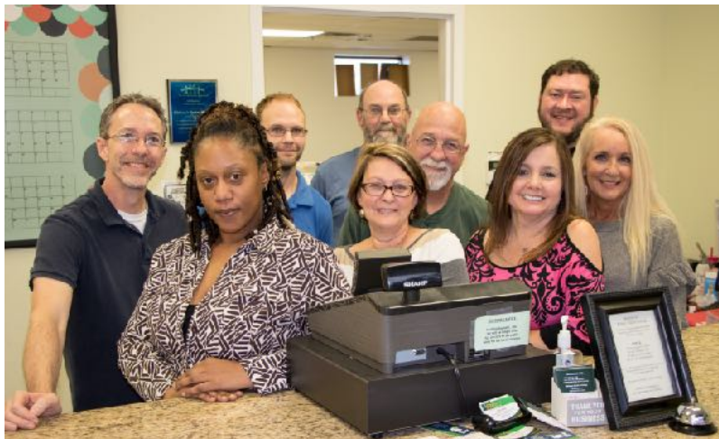
The Kirksey's Crew (left to right)

Shown below are the fine folks who make our Newsletter look great in print. It has been a pleasure to work with these lithographic professionals; without them the Newsletter would not look nearly as good as it does.